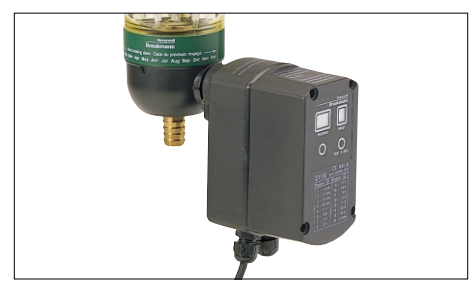
The MV876 Automated Backwash Motor is designed to clean your filter automatically, according to a programmed schedule. Instead of waiting for that telltale drop in water pressure, use the Automated Backwash Motor to keep your Honeywell F76 Filter running efficiently. Just set it once and forget it!

• Life will be simpler. The filter cartridge never needs to be replaced because the F76 filter screen is permanent. Jet cleaning debris from the screen requires a simple turn of a